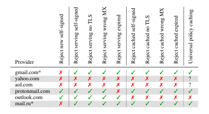
Table 5: MTA-STS delivery by scenario

Table 5 shows the results from our MTA-STS analysis. Our experiments show that yahoo.com and aol.com only request the MTA-STS record or policy when the server indicates support for STARTTLS. This is just a side note since they do not perform MTA-STS validation anyway. gmail.com and mail.ru are marked with an asterisk (*) since their behavior changed during our experiments. At first, they did not reject self-signed certificates and connections without STARTTLS support, even when an MTA-STS record and a policy were served. When these providers fetch a fresh policy that they have not yet cached, it is not immediately enforced in contrast to the behavior of protonmail.com and outlook.com . This exposes a major challenge of MTA-STS setups in practice. To reliably implement MTA-STS, large providers with multiple